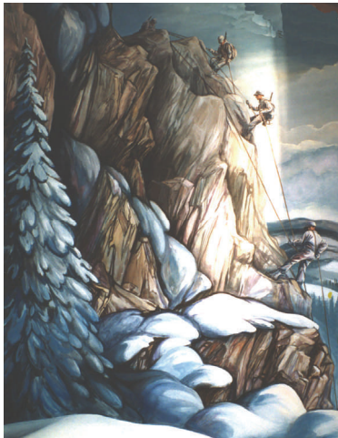
Painting by Roger Junak '61

Through the courage and stealth and daring of the 10th Mountain Division, and with the support and back-up of the participating forces in this operation, control of the Riva Ridge was established. This then led to the taking of Mt. Belvedere, the key mountain in the 120 mile long "Gothic Line" across the Apennines. Mt. Della Torraccia was also cap-