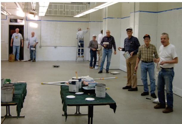
Volunteers begin to paint the walls of the Archives Room

walls and floors painted by a very enthusiastic group of volunteers from around the community. The IHS