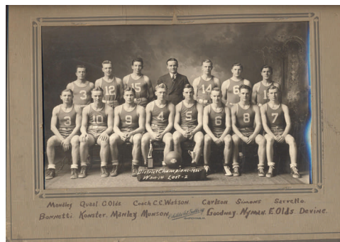
1936 Varsity Basketball Team