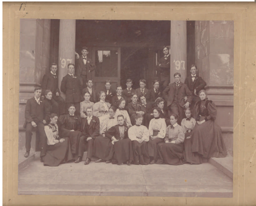
Class of 1897

One of the most fascinating items is an old board, found inside the wall of a home, with the signatures of the 1919 football team. Other interesting items were a 1901 Hematite yearbook